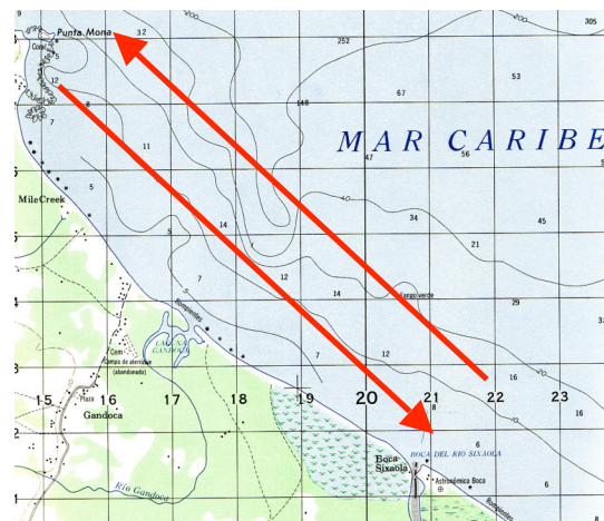
Fig. 1. Sixaola's cartographic map. (Sixaola, Limón, Costa Rica, 1:50 000, Instituto Geográfico Nacional).